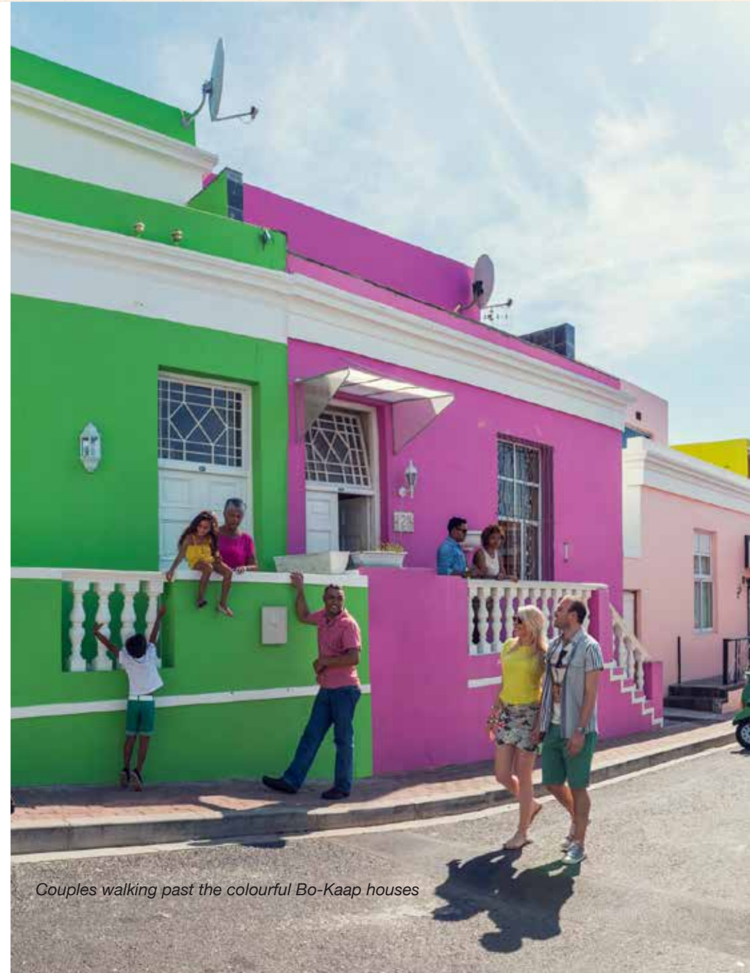
Couples walking past the colourful Bo-Kaap houses

Accounting Officer Department of Tourism Date: 31 May 2018